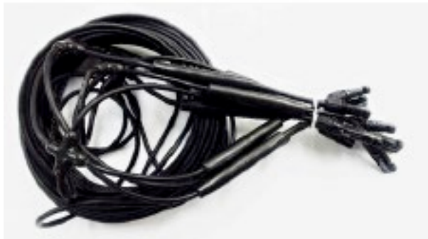
Figure 1. Wiring harness made by Hikam America has eight branches, each protected by a Littelfuse supplied in-line DC fuse.

Even more important, the wire harness with in-line fuses offers dramatic cost reductions for EPCs and project investors. By fusing in-line instead of in the combiner box, the harness reduces the total number of inputs into a combiner box. Multiple protected strings are combined in the harness, having fewer inputs with higher ampacity coming into the box.